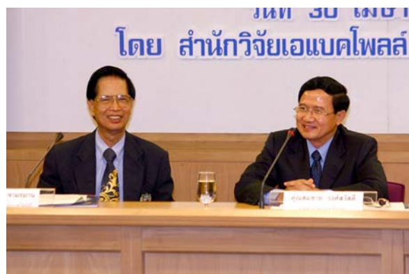
Figure 5. H.E. Somchai Wongsavat, Permanent Secretary of Justice (Later Prime Minister) with Prof. Srisakdi, Chairman of ABAC POLL.