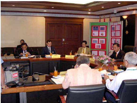
Figure 1. ABAC Poll Seminar on “Drugs Suppression Activities”, 25 July 2005.