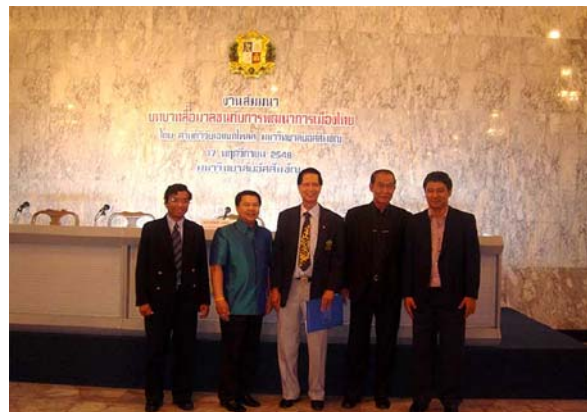
Figure 4. ABAC Poll Seminar on “Roles of Mass Communication in Development of Political Affairs”, 17 November 2005.