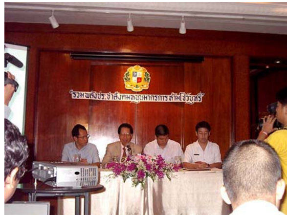
Figure 3. ABAC Poll Seminar on “Measures Against Smoking”, 11 November 2005.

Sample photographs of ABAC Poll activities are shown in Figures 1-7.