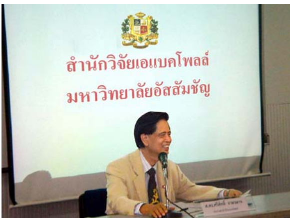
Figure 2. ABAC Poll Seminar on “Dangers to Female”, 10 November 2005.

Sample photographs of ABAC Poll activities are shown in Figures 1-7.