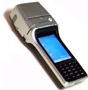
Fig. 2 Handheld barcode reader system

designed for working in a factory, as shown in Fig. 2. Hence, it is cost prohibitive to deploy the 2D barcode based system for supply chain integration in a large scale.