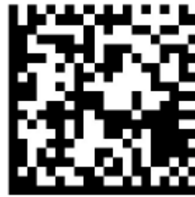
Fig. 1 The Semacode tag containing URL http://www.searcc07.com

In this paper, the Semacode has been utilized. Examples of the Semacode is shown in Fig. 1